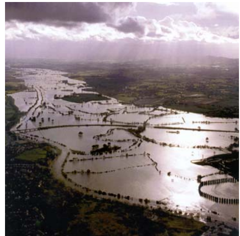
Flooding can affect water quality and can happen very quickly.

By regularly checking the water quality (dissolved oxygen, temperature, pH and ammonia) you will be able to spot problems before they develop. This will also help you to understand what is normal for your fishery and is good fishery management.