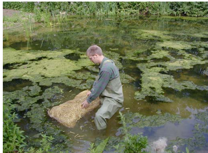
Excessive weed in a fishery. Sometimes barley straw can be used to reduce the amount of weed.

Rapid changes in the amount of oxygen can also cause distress and death of fish. This can occur if there is an algal bloom or the lake is very deep.